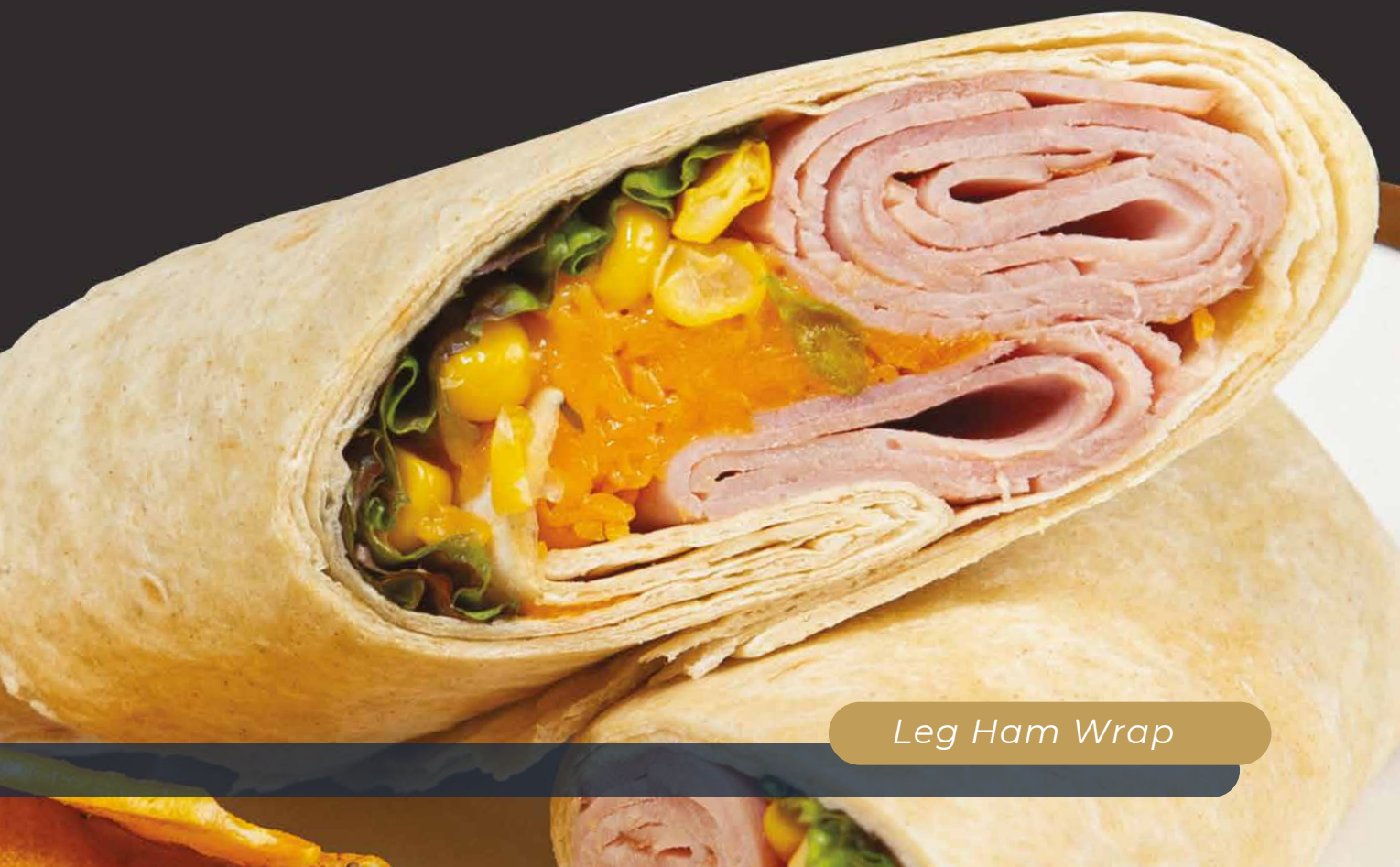
Leg Ham Wrap