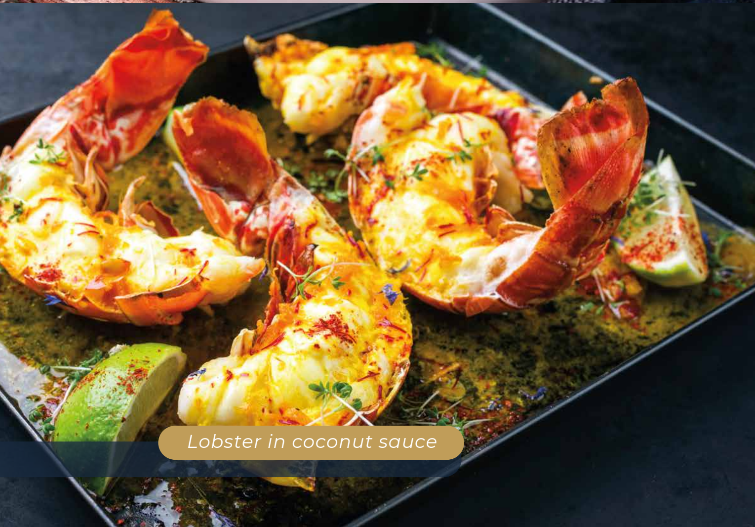
Lobster in coconut sauce