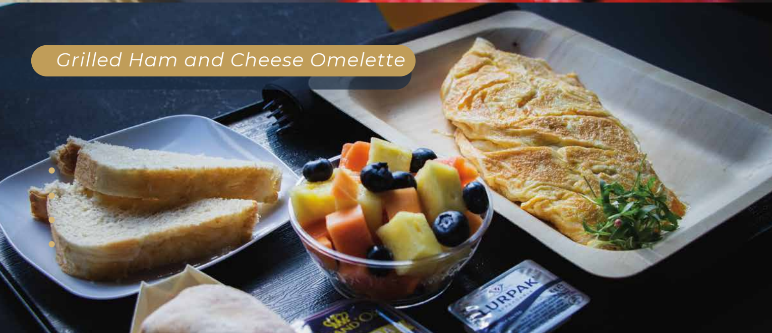
Grilled Ham and Cheese Omelette