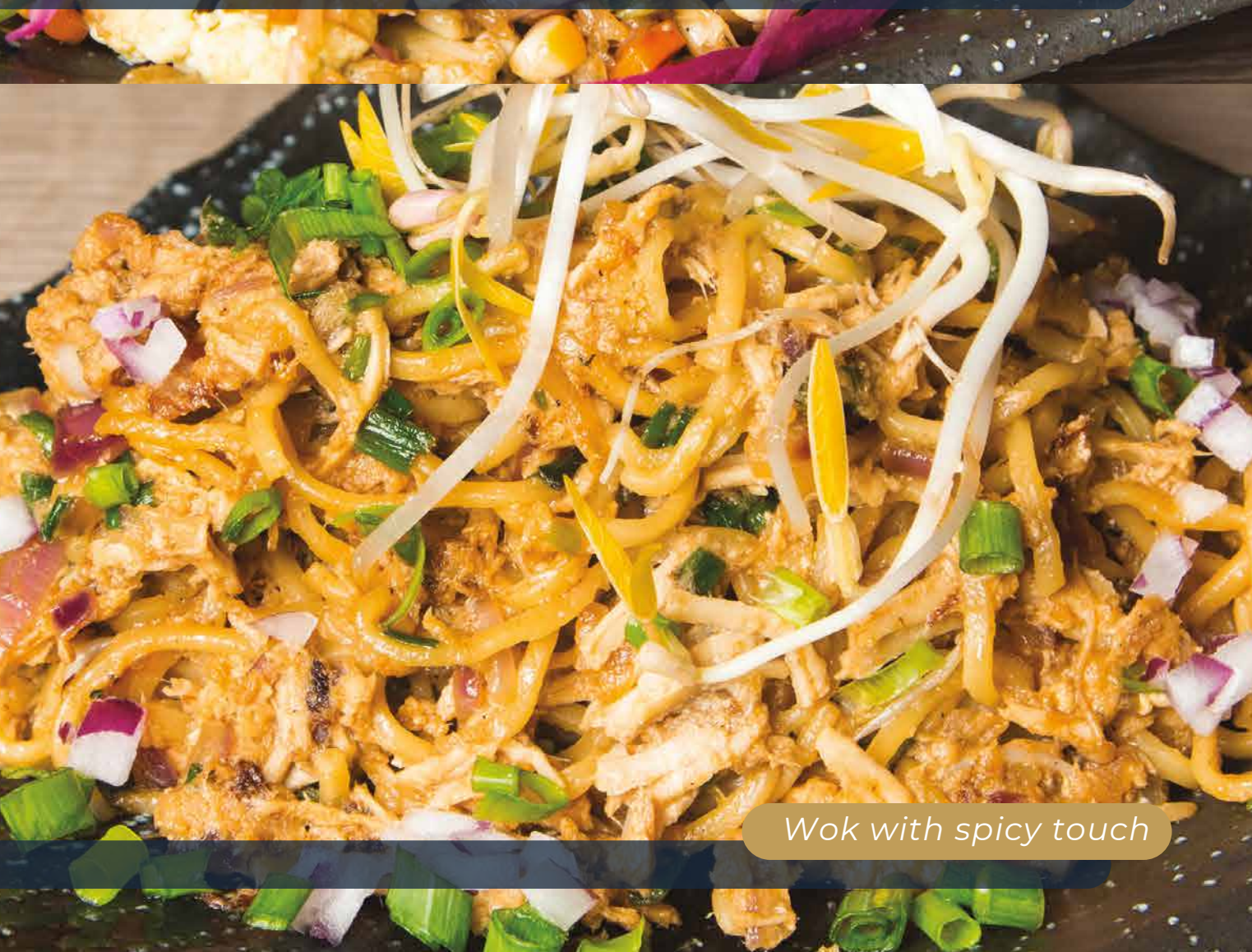
Wok with spicy touch