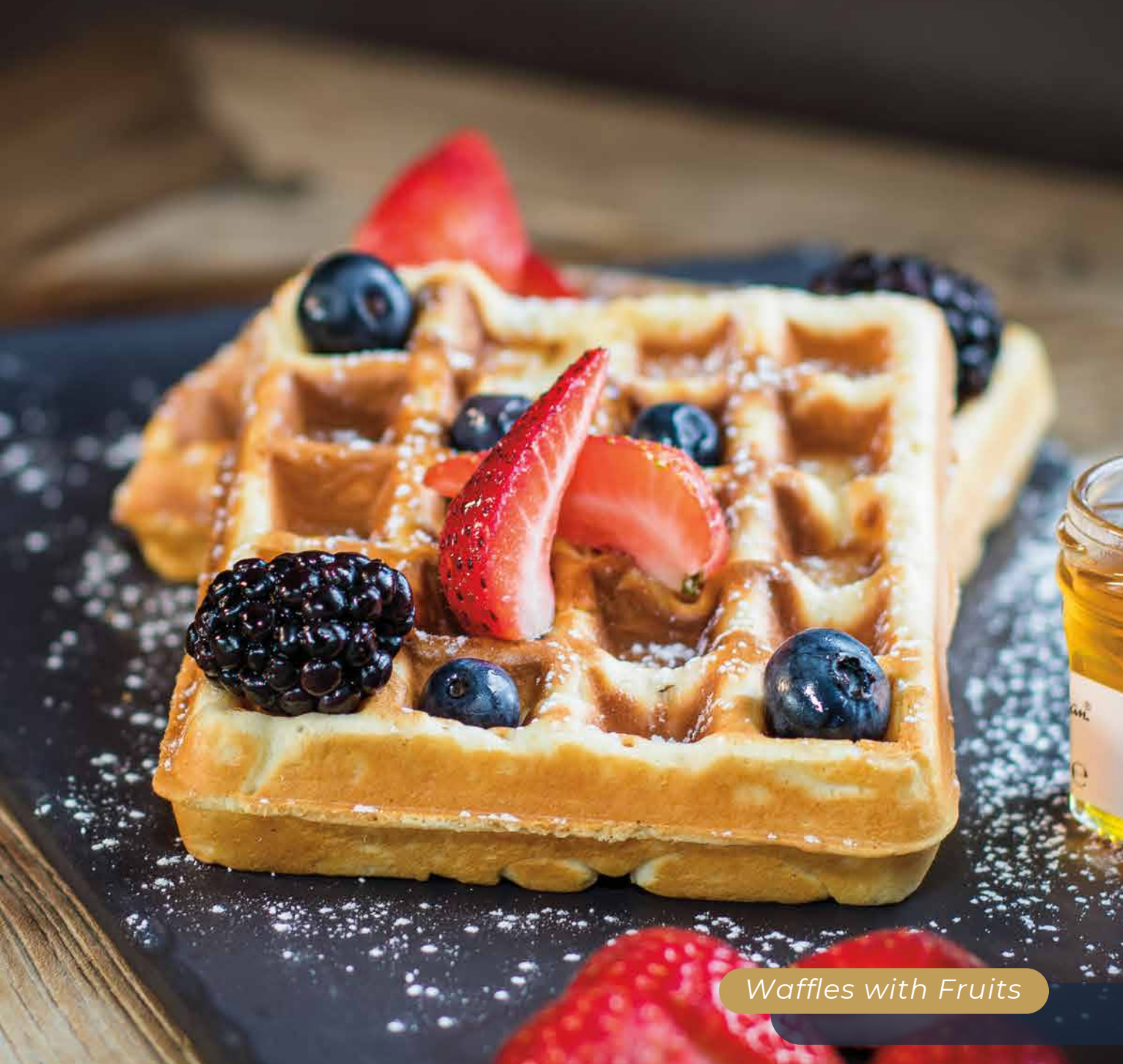
Waffles with Fruits