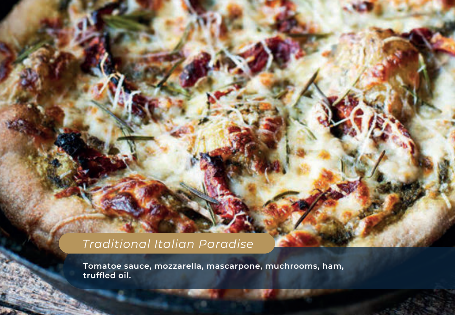
Traditional Italian Paradise

Tomatoe sauce, mozzarella, mascarpone, muchrooms, ham, truffled oil.