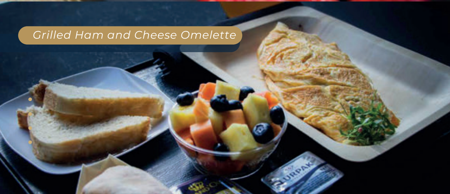
Grilled Ham and Cheese Omelette