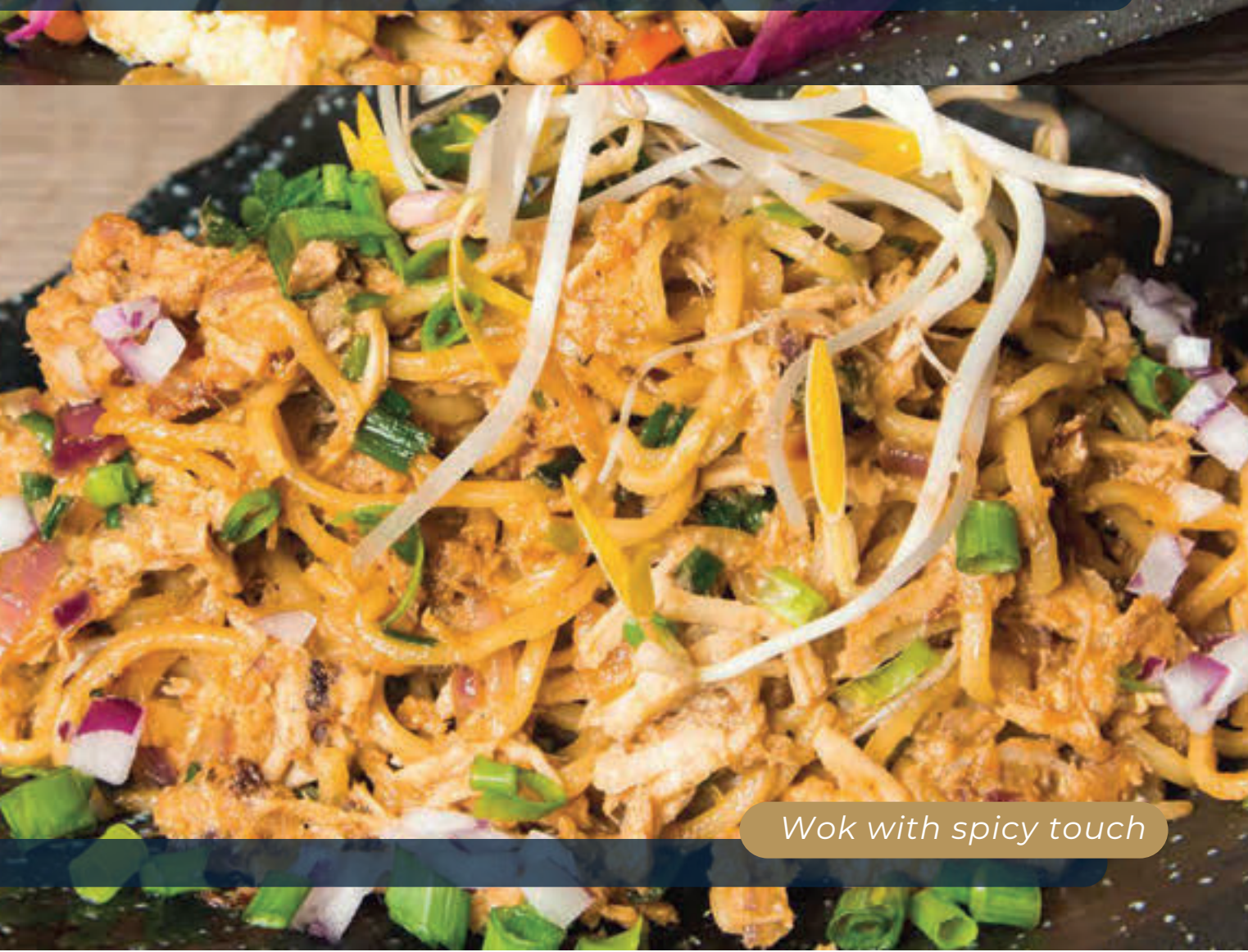
Wok with spicy touch