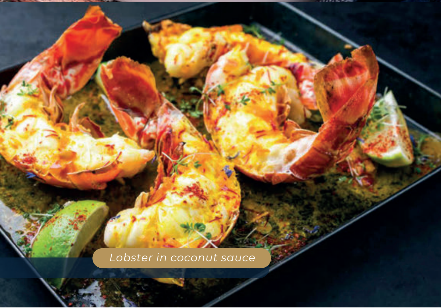
Lobster in coconut sauce